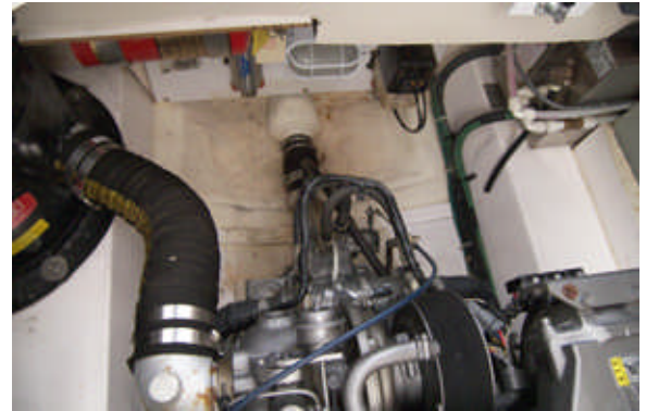
Engines and mechanical spaces